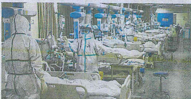
KAKITANGAN perubatan dalam sut perlindungan merawat pesakit koronavirus baharu di unit rawatan rapi di sebuah hospital khusus di wilayah Wuhan.

Hasil perkembangan terbaru ini bermakna tiga pesakit pulih koronavirus baharu yang dirawat di negara ini.