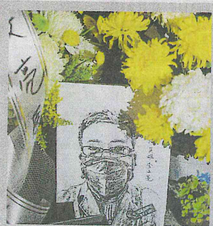
POTRET pakar mata, Dr Li Wenliang diabadikan bersama jambangan bunga di Hospital Pusat Wuhan. Li yang menjadi korban coronavirus adalah antara pakar perubahan pertama mengesan penularan wabak itu, tetapi menerima tekanan daripada kerajaan China.

Menurutnya, aktiviti pengesanan kontak masih dijalankan dan akan dimaklumkan dari semasa ke semasa.