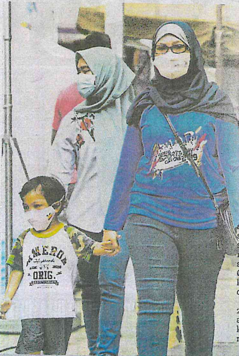
ORANG ramai memakai penutup mulut dan hidung ketika bersiar-siar di Suria KLCC di ibu kota.