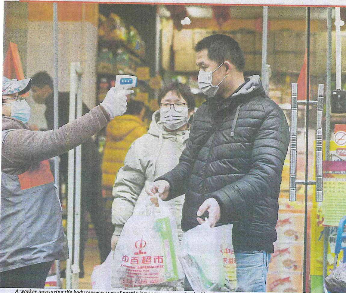
A worker measuring the body temperature of people leaving a supermarket in Qingshan district, Wuhan, on Friday.