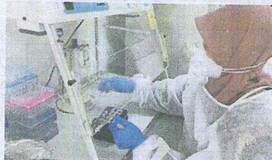
A real-time RT-PCR 2019-nCoV optimisation test being conducted.

IMR, he said, conducted training for real-time RT-PCR tests at 12 hospitals and health labs in Ipoh, Kota Kinabalu, Kota Baru